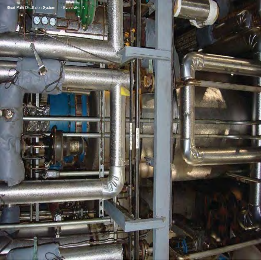
Short Path Distillation System III - Evansville, IN