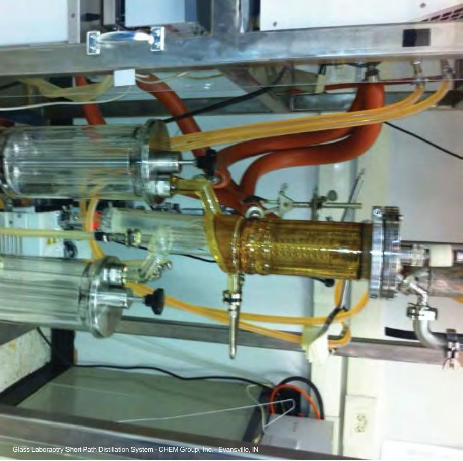
Glass Laboratory Short Path Distillation System - CHEM Group, Inc. - Evansville, IN