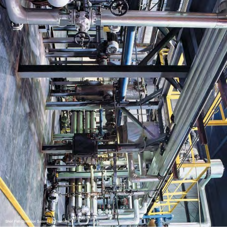
Short Path Distillation System 1 - Evansville, IN