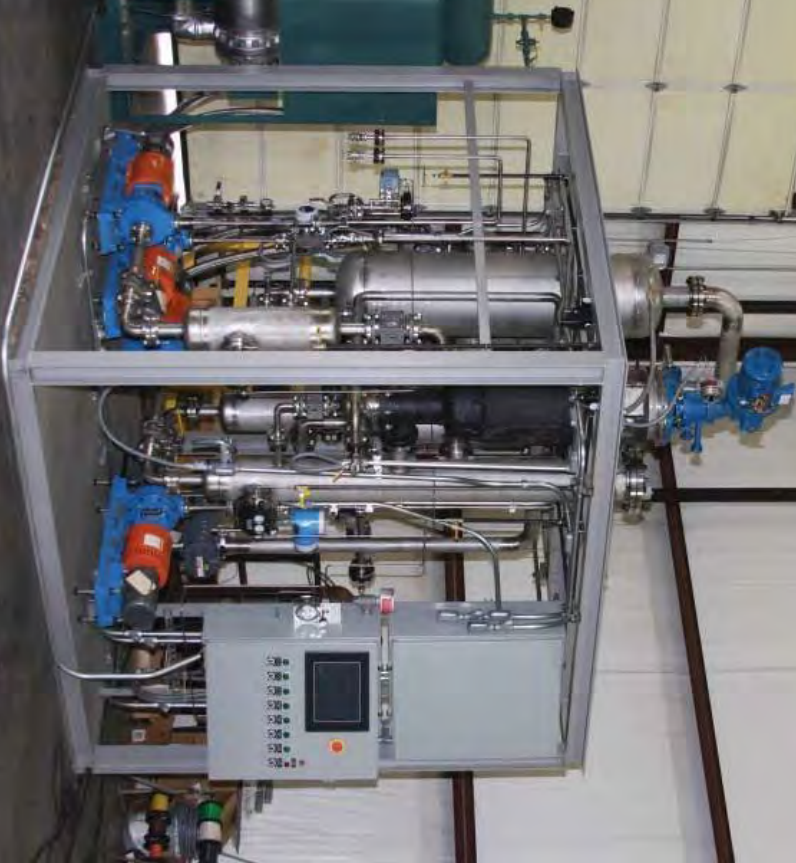
Portable "Mini" Short Path Distillation System - Hartland Distillations, Inc. - Evansville, IN